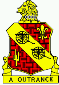
1 ST BN 112 TH FA Btry D 112 TH FA