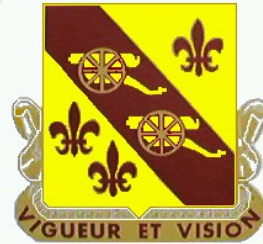
228 TH FA BN 228 TH Armored FA BN